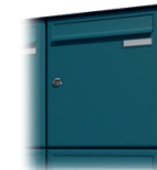
Casing from sheet steel