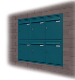
Recessed into the wall